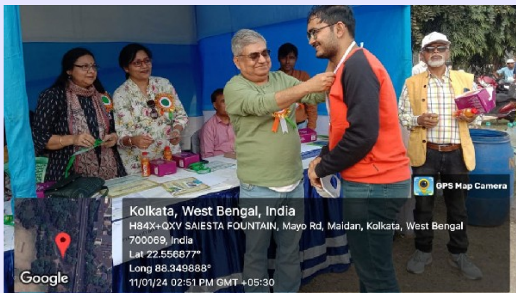
Annual Sports: 11.01.2024

and Cricket Tournament and Athletic Meets.