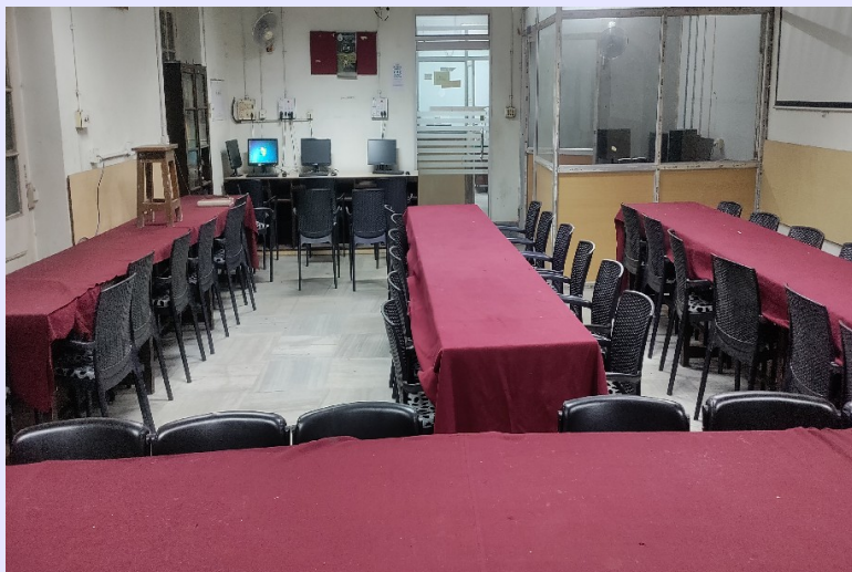
Reading Room-Central Library