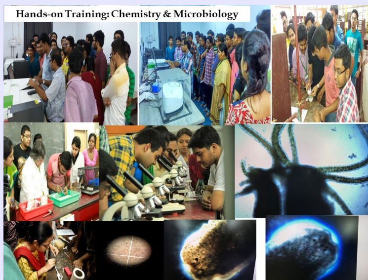
DBT Star College Sponsored Hands-on-Training Session

Star College Scheme has been initiated by The Department of Biotechnology (DBT), Ministry of Science and Technology, Government of India, New Delhi to support colleges offering undergraduate education in order to improve science teaching across the country. Maulana Azad College is the only college in Eastern India who bagged the STAR STATUS from DBT in 2017. Five Science Departments (Physics, Chemistry, Botany, Zoology and Microbiology) are benefitted from this scheme for strengthening their academic and physical