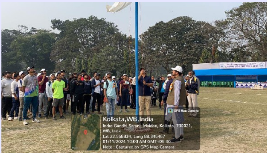
Annual Sports: 11.01.2024