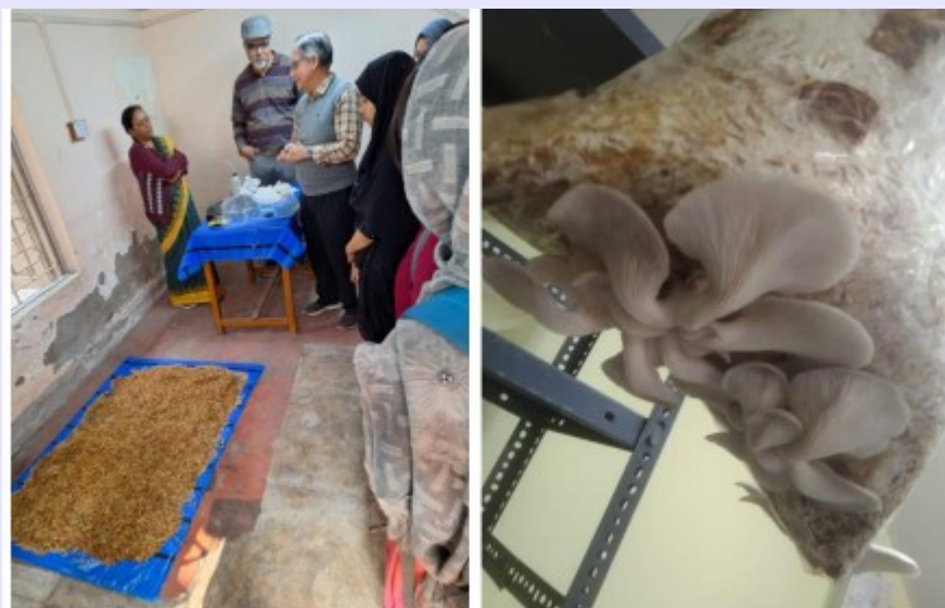
Mushroom Cultivation Workshop for entrepreneurs