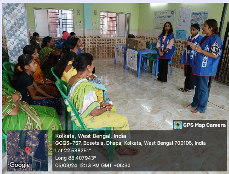
Awareness programme on Women's Health & Hygiene: 05/03/24