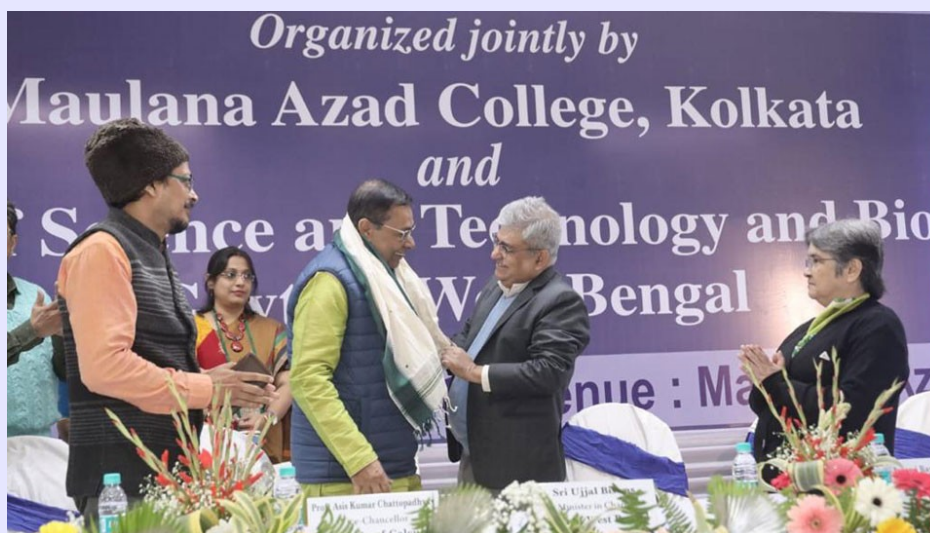
Regional Science & Technology Congress' 23

The College encourages the Departments to organize seminars, conferences and Invited Lectures on relevant themes during each academic session. The Departments