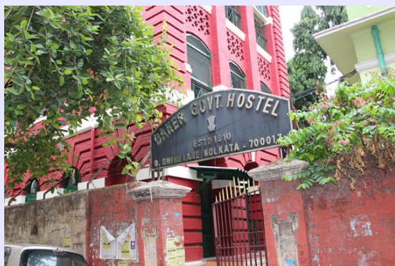
Baker Government Boys' Hostel

Girls' Hostel: A 72 seat Girls' Hostel is at 19, Haji Mohamad Mosin Square, Kol-16 (It is 200m away from the College Premises).