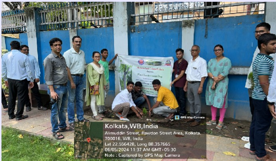
World Environment Day Observation, 2024 in collaboration with Microbiologists Society, India.

More info: https://maulanaazadcollegekolkata.ac.in/seminarsgallery.php