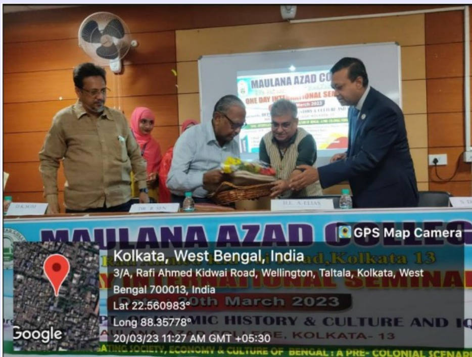
International Seminar on ‘Interrogating Society, economy and culture of Bengal: A Pre-colonial Scenario’